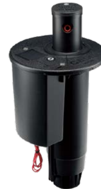
G880E Pop-up height: 8 cm Overall height: 30 cm Flange diameter: 18 cm Female Inlet: 1½" ACME