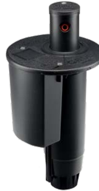
G880C Pop-up height: 8 cm Overall height: 30 cm Flange diameter: 18 cm Female Inlet: 1½" ACME

▶ = TTS and DIH Advanced Features detailed on pages 154 and 156